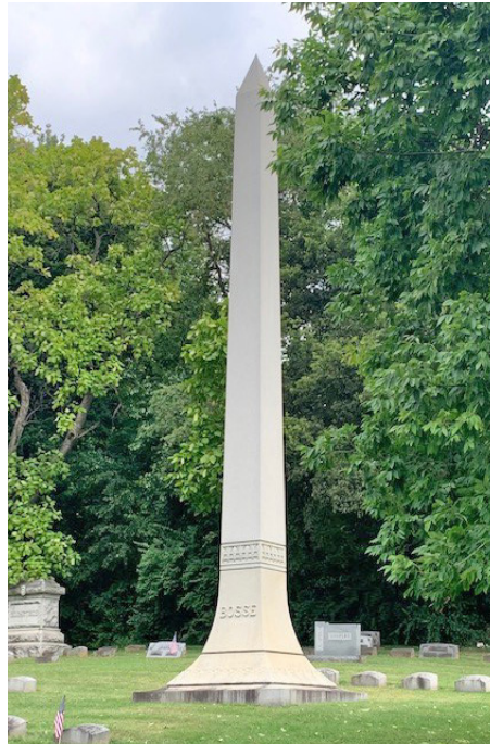
Pictured is the Benjamin Bosse grave site.

Under Mayor Benjamin Bosse, the city of Evansville grew at its fastest pace (22%), second only to the growth during WWII (33%). Mayor Bosse's death at the age of 49 completely shocked the community. His legacy remains with a high school named in his honor and an athletic stadium that can be seen in the movie A League of Their Own .